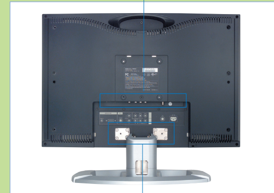
REMOVABLE STAND FOR OPTIONAL WALL MOUNTING