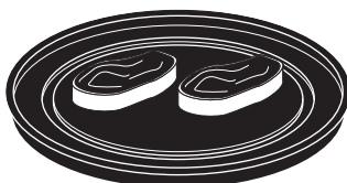
Side by Side (meats, poultry)