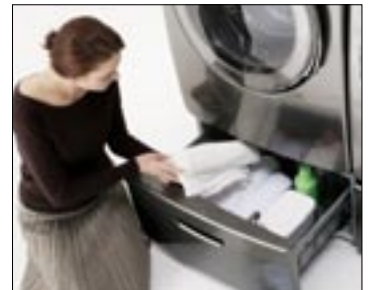
Optional Convenient 15" Pedestal

Design and specifications are subject to change without notice. Non-metric weights and measurements are approximate.